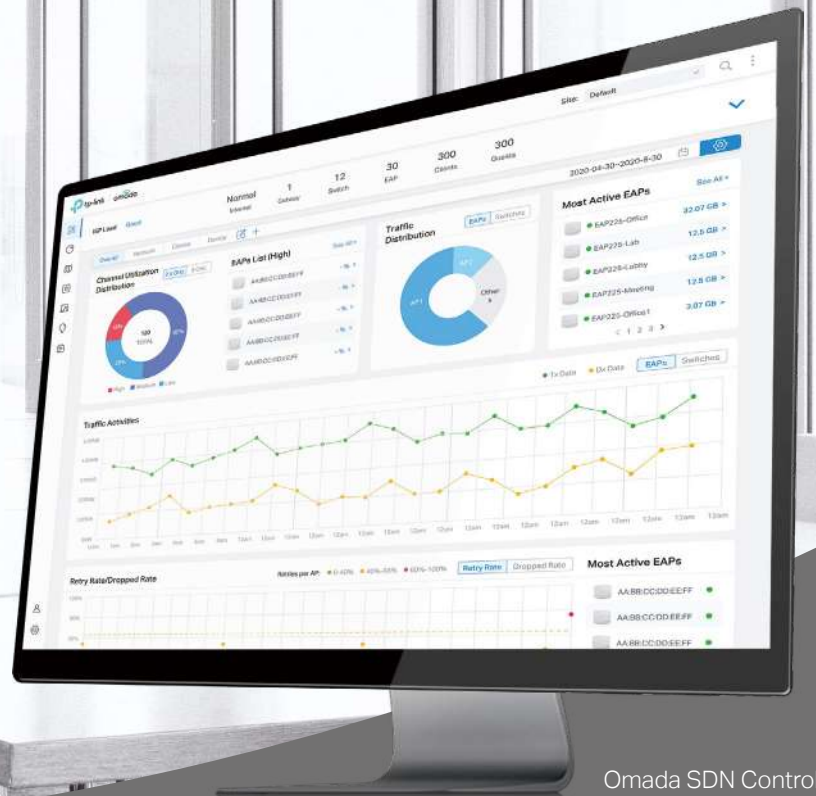
Omada SDN Controller